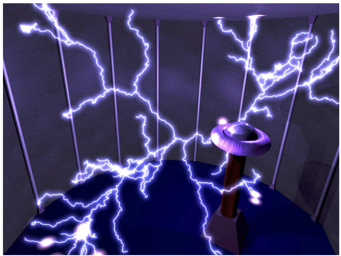
Fig. 7. A Tesla coil discharging, generated with 500,000 particles with our algorithm. The physical foundation of our algorithm makes the simulated lightning streams repulse each other naturally, producing a self-avoiding pattern without any user intervention.