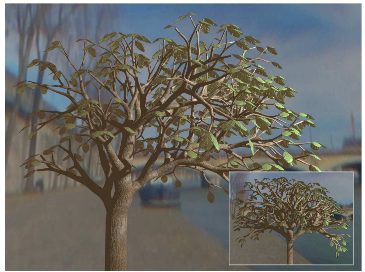
Fig. 6. A tree demonstrating bias toward a light source (in the upper right), automatically generated with our method incorporated into "environmentallysensitive" L-Systems. Inset: a tree grown with the same L-System, without environmental bias.