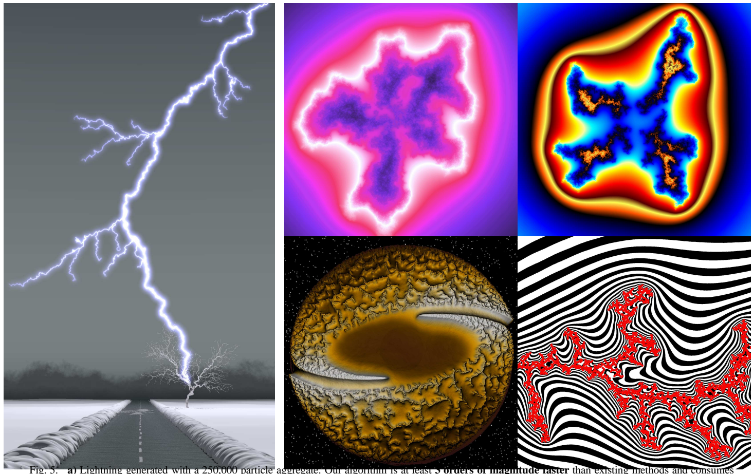
Fig. 5. a) Lightning generated with a 250,000 particle aggregate. Our argonition is at least 5 orders of magnitude raster than existing methods and consumes at least 2 orders of magnitude less memory. b) 2D Fractal forms generated with our algorithm. The SIGGRAPH logo is a frame from a short animation featured in the SIGGRAPH 2005 Electronic Theater.