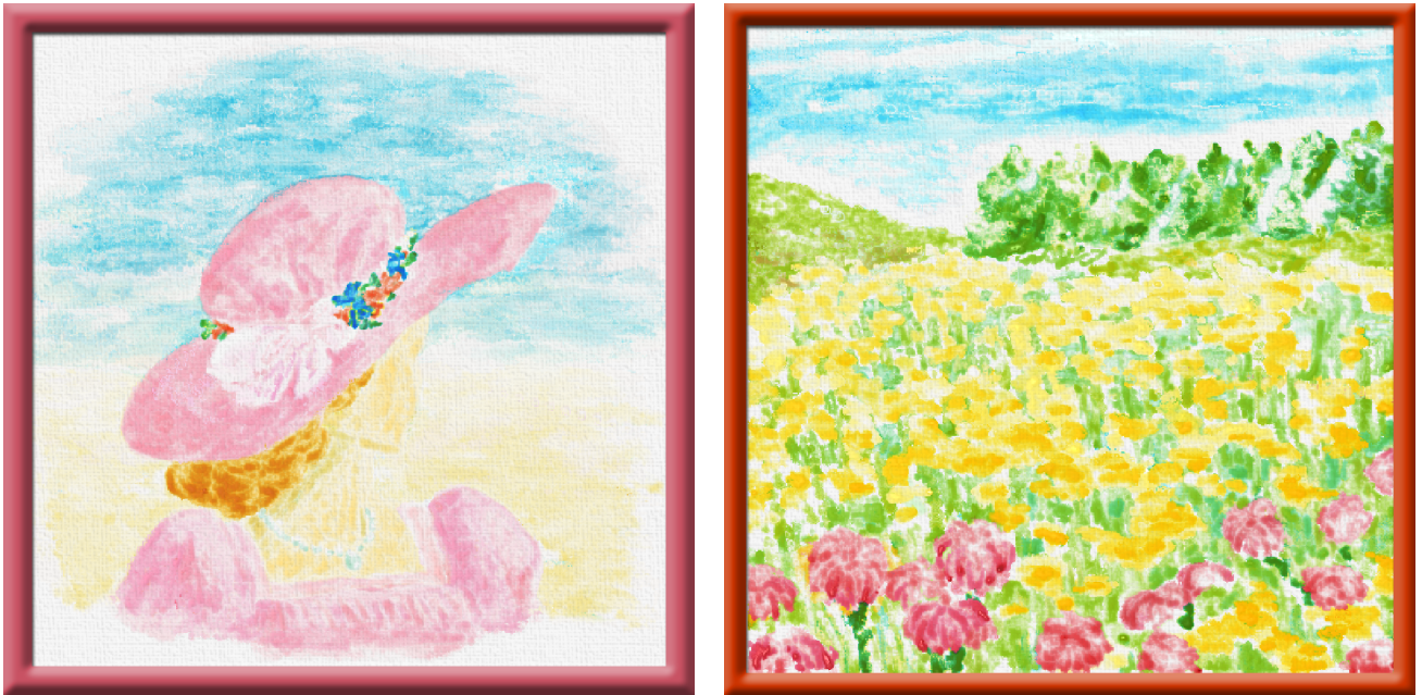
Figure 3: Some images hand-painted using our paint model.