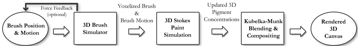
Figure 2: System Architecture

Our novel viscous paint medium supports important new features, such as impasto-like strokes and the ability to build up many layers of paint, both wet and dry, gouging effects from brush marks, per-pixel lighting effects, rendering of paint bumps, etc. The surfaces of the brush, palette, and canvas are coated with paint using this model. A schematic diagram illustrating how various system components are integrated is shown in Fig. 2.