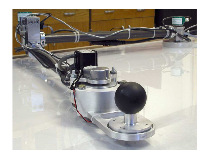
Figure 2: A 2-dof cobot, which presents stiff yet smooth constraint paths to a human user grasping the handle. The wide, low design allows large constraint forces and a full range of human arm motion.

Figure 1: Exploration of an object using a probe or stylus takes advantage of distal attribution—the ability for humans to easily extend their perception to the end of an implement. This approach, however, diminishes or eliminates access to basic surface features such as temperature, contour, and even certain aspects of texture.