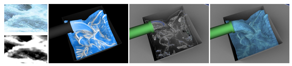
In Reference to Figures 1,7